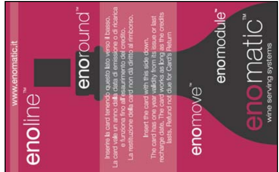
Enomatic Branded Back