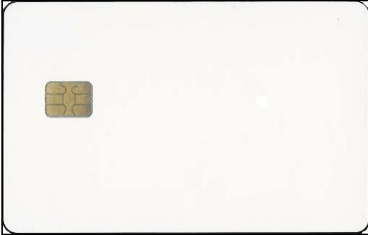
Blank Wine Card